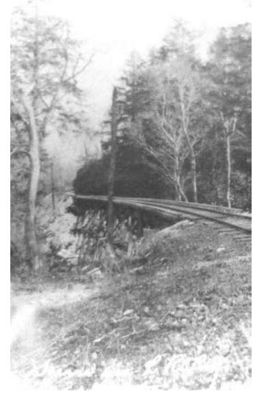
Linville River Trestle, around 1911

Cy Crumley Scrapbook can be found online at http://www.johnsonsdepot.com/crumlev/tour3a.htm