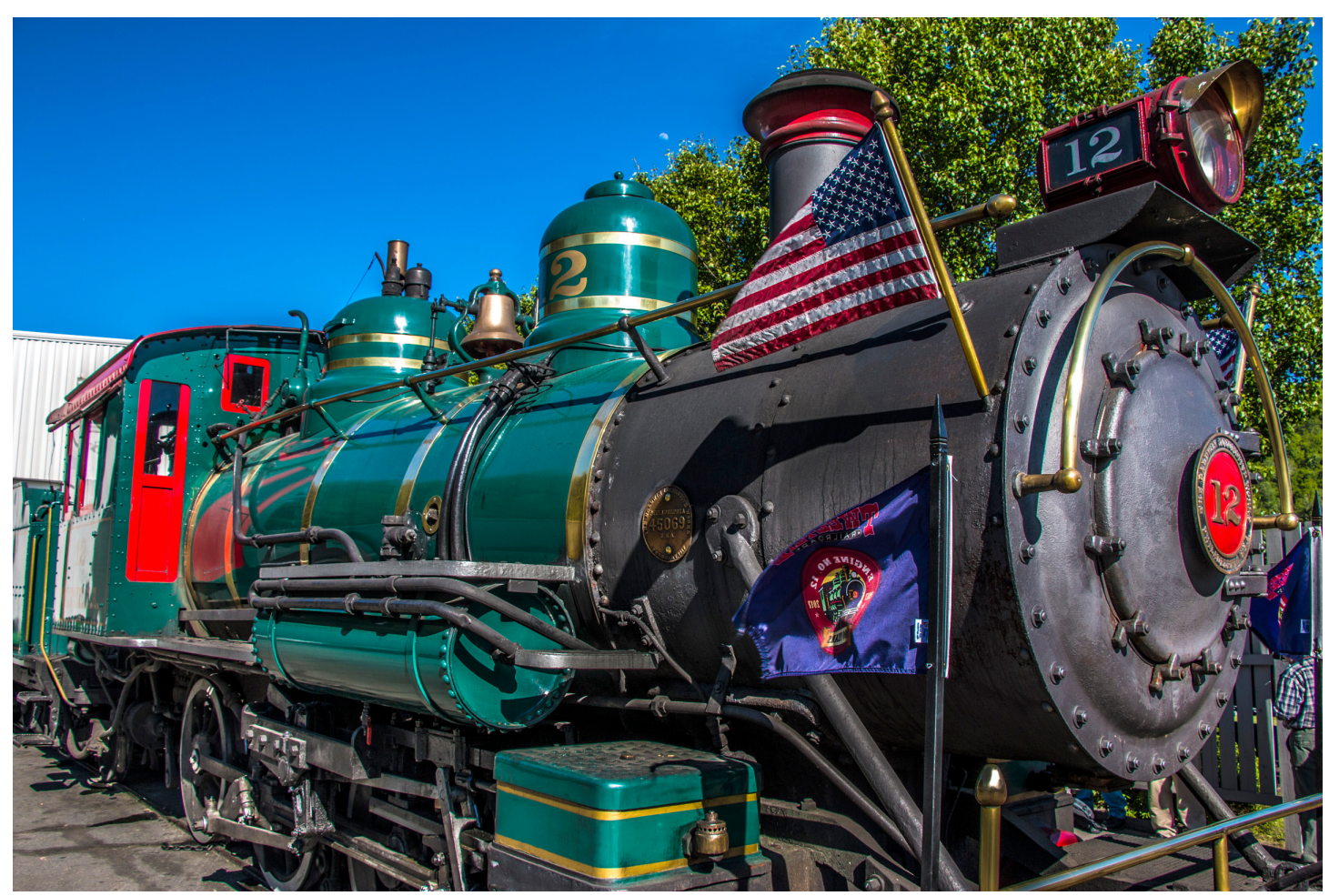
Former ET&WNC Railroad engine number 12 sits in front of the Tweetsie Railroad shop building. The occasion was her 100th birthday celebration by the ET&WNC Railroad Historical Society during their annual convention. The visit included a historical lecture and question and answer session by Johnny Graybeal about the famous engine. A bad check valve kept her from getting to run that weekend.

A question often asked is "When can I see #12 running?" As we have experienced, Tweetsie Railroad normally runs #12 in the early part of the season and during Ghost Train, when the spookily decorated #190 only comes out at night. October is a great time to photograph #12 on the trestle surrounded by fall colors. The cab in #190 is better ventilated so is less hot on the crew during the warmest summer days. Remember, of course, steam locomotives are living, breathing machines with strong personalities. Being machines, they're also subject to mechanical difficulties. While the shop is on top of things, sometimes when you visit, one of the engines may be down for maintenance. It can be a minor problem or a complete rebuild as we have seen over the years. So pack your patience along with your camera.