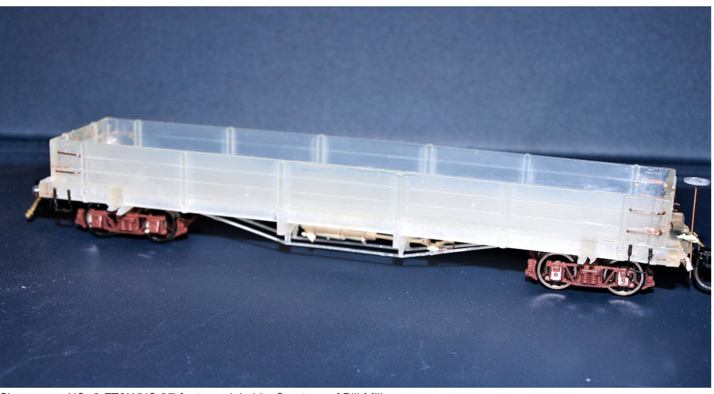
Shapeways HOn3 ET&WNC 37 foot gondola kit.