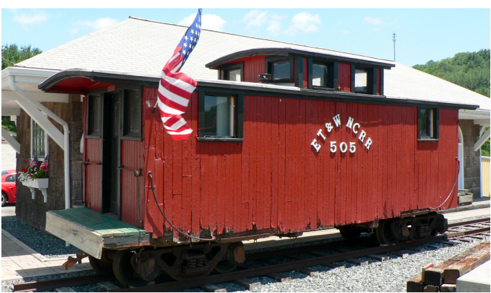
Caboose 505 at the Linville Depot in Newland shortly after "delivery" in 2013.

The next step for the 505 caboose is to do the cupola siding. The reason I did the siding on the bottom first was because the roof laps over the siding. I left the siding covering the windows to protect the inside from the weather until I can get new window frames and glass built and ready to go back in. Then we will start on a new roof. We will work as funds will allow. With a little or a lot of work, a little facelift and some paint, the old girl will be beautiful again.