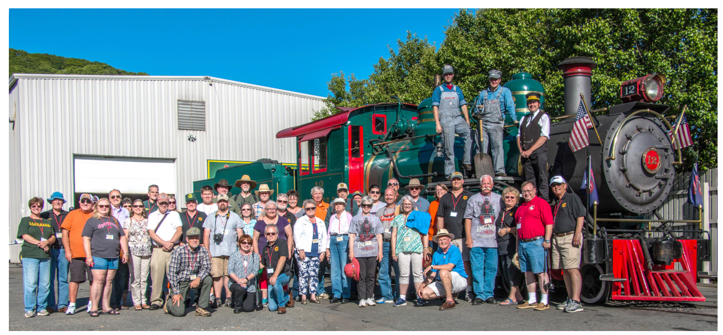
Society convention attendees and train crew, awaiting their annual Saturday evening train ride and fried chicken, gather for a group photo in front of 100-year-old ET&WNC Railroad engine #12 at the Tweetsie Railroad shop. The weekend's beautiful weather was a bonus for all the organization's outdoor activities.

Editor's note: I'm honored to be asked to edit the ET&WNC Railroad Historical Society newsletter. My plan is to keep the group up-to-date with news from all areas of ET&WNC preservation and the latest from the modeling community. This is of course YOUR newsletter. As society members, I welcome your input on new topics that may be of interest to the group, and corrections to any booboos I make. I can be reached at — curtis.brookshire@verizon.net.