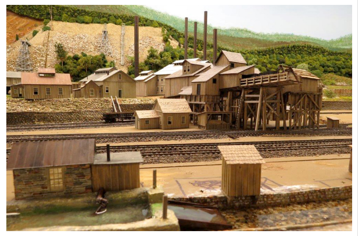
The HOn3 model of the Cranberry Mine complex nears completion on the ET&WNC Railroad layout in the George L. Carter Museum at ETSU.

Plan to visit the Carter Railroad Museum on the campus of East Tennessee State University in Johnson City, TN any Saturday from 10 am to 3 pm and tour the ET&WNC Railroad in miniature for yourself. The little narrow gauge trains are running Every Time With No Complaint.