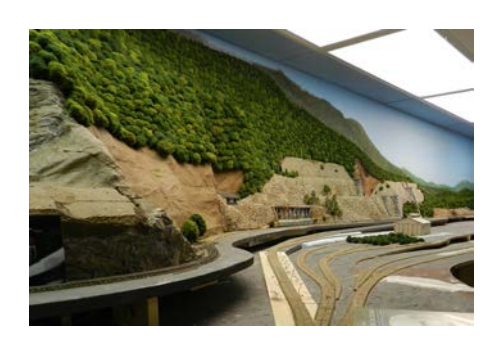
Modular at Johnson City , Tennessee, a work in progress.

Despite low numbers attending, the mood of the convention was that of excitement, and anticipation of what the next year can bring. Please make plans now to attend the 2014 Convention.