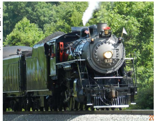
Pictures of the Southern 630 taken at the Y in Barber, NC June 16, 2012